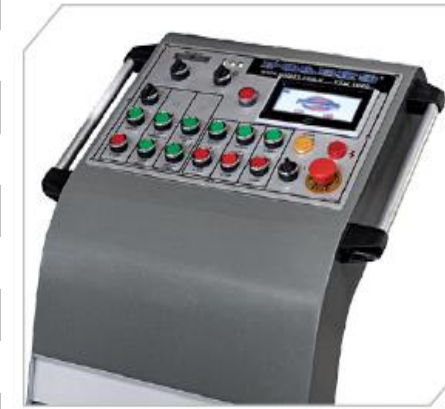
Dokunmatik ekran ve tuş takımlı kontrol paneli Control panel with touchscreen & buttons