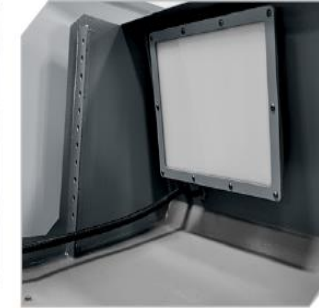
Taşın işe yaklaşma led aydınlatması Wheel flat surface approaching led light.