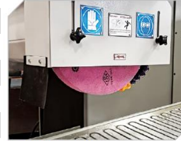
Ayarlanabilir taş muhafazası Configurable grinding wheel cover