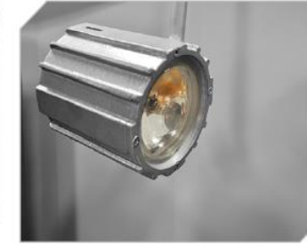
İş aydınlatma lambası Work lighting lamp