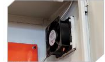
Elektrik panosu soğutma sistemi Electric panel cooling system