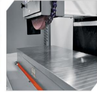
Manyetik tabla Magnetic table