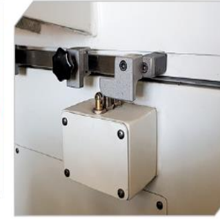
Sınır siviçleri Limit Switches