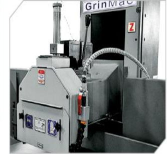
Kafa üzeri taş bileme aparatı Wheel dressing apparatus on cutting head