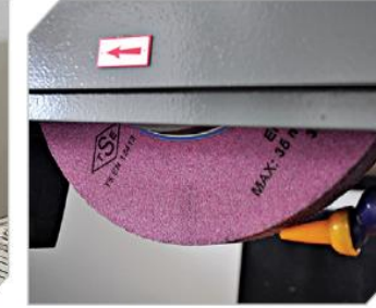
Basınçlı soğutma suyu çıkışı Pressure cooling water outrun