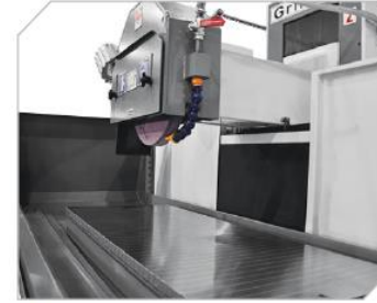
Manetik tabla Magnetic table