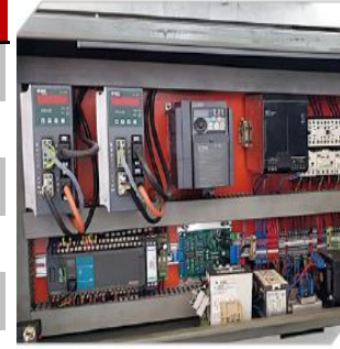
Elektrik panosu Electric panel